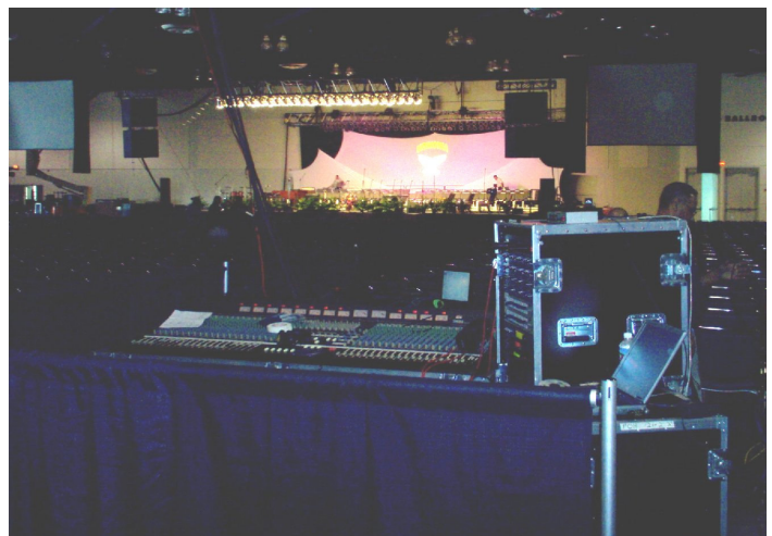
Ontario Convention Center Show for 5000